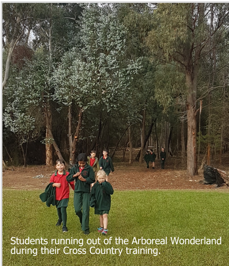
Students running out of the Arboreal Wonderland during their Cross Country training.